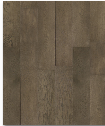
JHWO00109 Eagle Rock