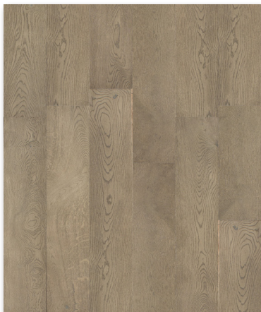
JHWO00107 Nimmo Bay