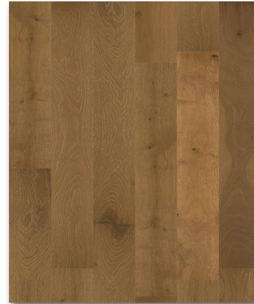
JHWO00105 Port Royal