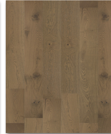
JHWO00102 Portage Bay