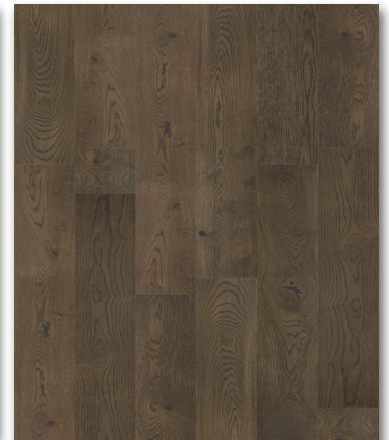
JHWO00110 Brentwood Bay