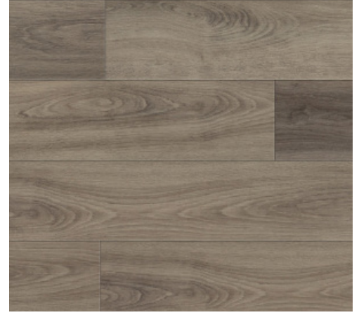
CHCW1469 Park Place*