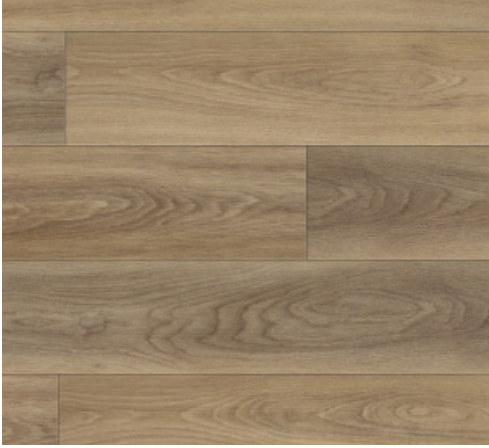
CHCW1467 Sugar Ridge*

4.2mm thick Luxury Vinyl with Micro-Beveled Edges and an Attached Premium Pad