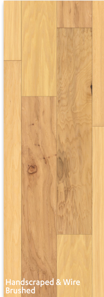
Handscraped & Wire Brushed