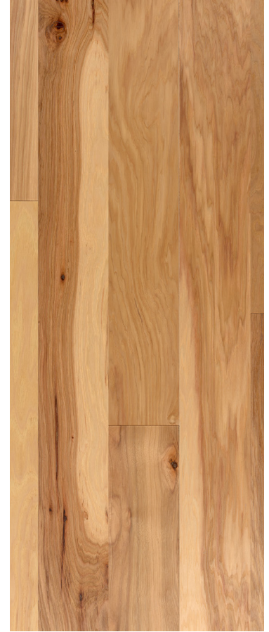
HUWD0213* Heritage Hickory