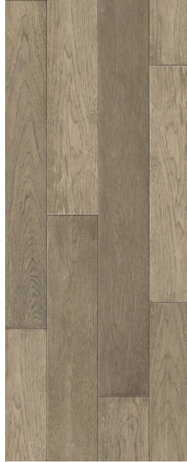
JHWD0405 Granite Hickory