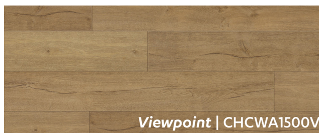
Viewpoint | CHCWA1500V