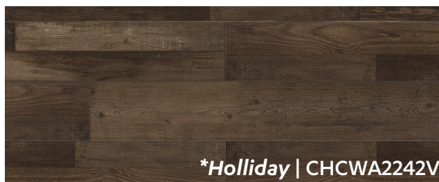
*Holliday | CHCWA2242V