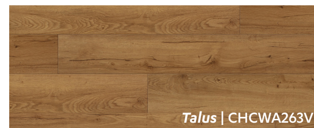
Talus | CHCWA263V