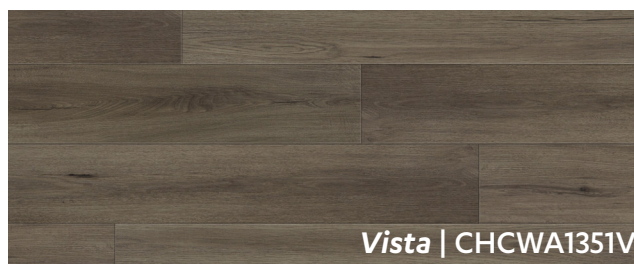
Vista | CHCWA1351V