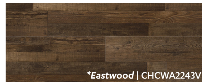
*Eastwood | CHCWA2243V