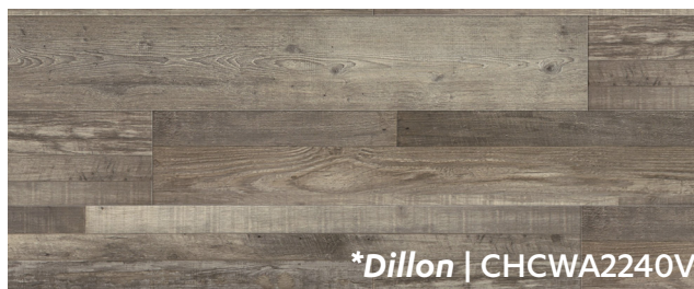
*Dillon | CHCWA2240V