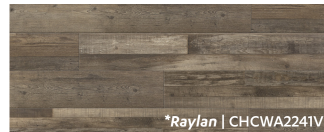
*Raylan | CHCWA2241V