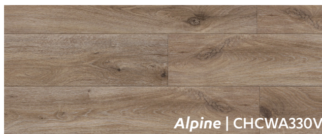
Alpine | CHCWA330V