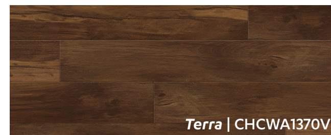
Terra | CHCWA1370V