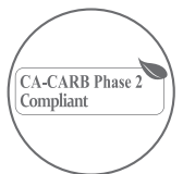
CA-CARB Phase 2 Compliant