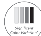
Significant Color Variation*

Equinox can be installed over 4,000sf with no expansion moldings