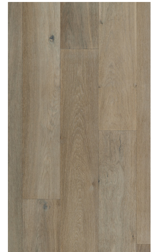
Old Northern HFTALVRO1275ON

Board-to-Board Color Variation: Hardwood may have a wide variety of color and/or grain variation from board-to-board.