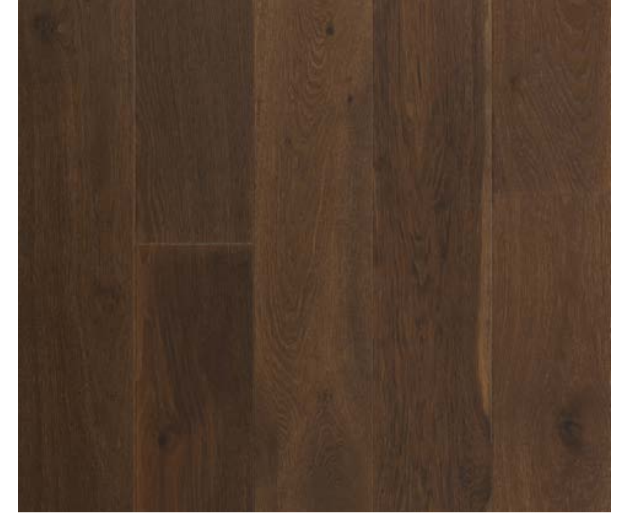
Canoe Point HFTALVRO1275CP