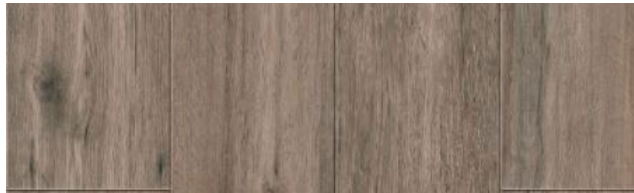
RCRC0205 | Collins