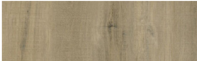
RCRC0209 | Hera