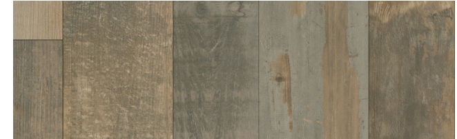
RCRC0207 | Saturn