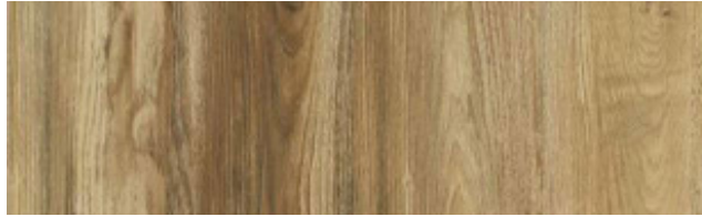
RCRC0206 | Hermes