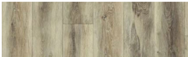
RCRC0204 | Seacliff