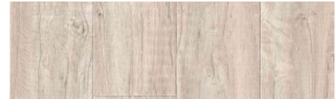
RCRC0208 | Zeus