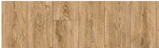
RCRC0202 | Midfield