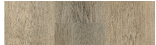
RCRC0201 | Regis