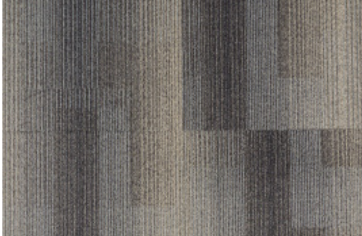
NE811011 Iron Ore