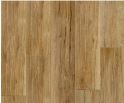
AGRCU0301 | O.A.T.