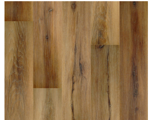
AGRCU0307 | Thrust