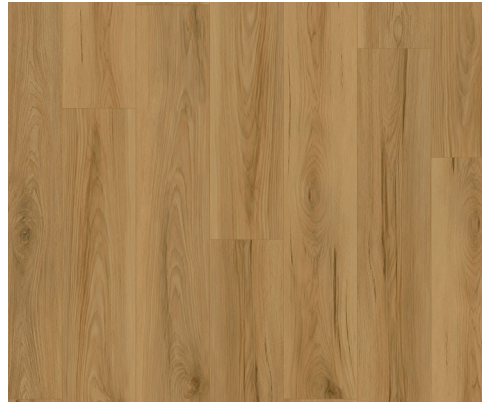
WIRC0502 | Lager Hickory