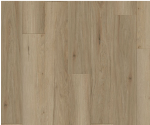
WIRC0501 | Tanunda Hickory