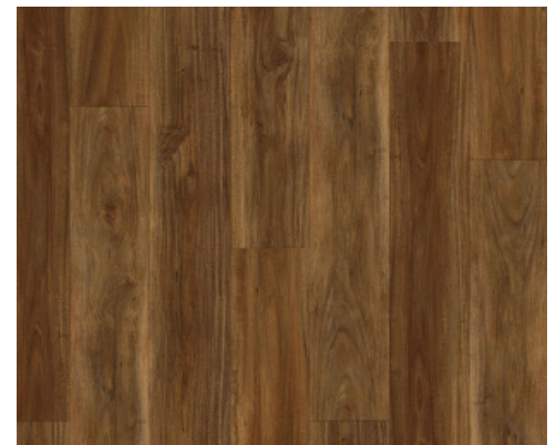
WIRC0506 | Calla Acacia