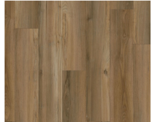
WIRC0503 | Porter Hickory