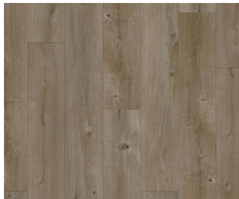
WIRC0505 | Yebinna Oak