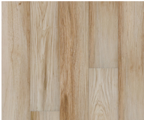
Dahlia | CTLV0105