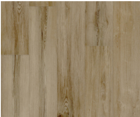
Lift | NFRCU0305