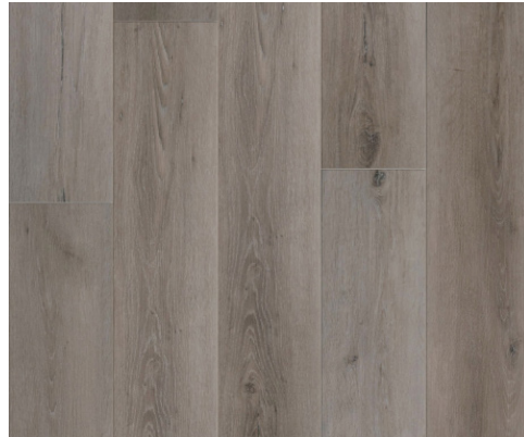
Camber | NFRCU0302