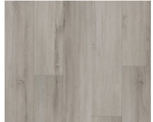
Magneto | NFRCU0304