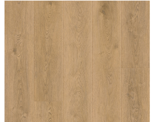
Middlebury | WIRC0403