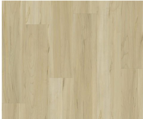
Greensboro | WIRC0402