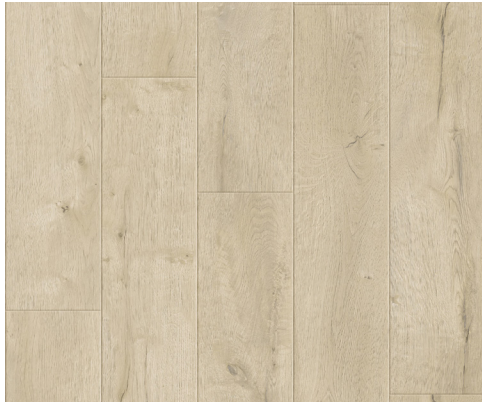
Nicholas | WIRC0401