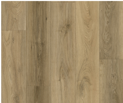
Carlsberg | WIRC0404