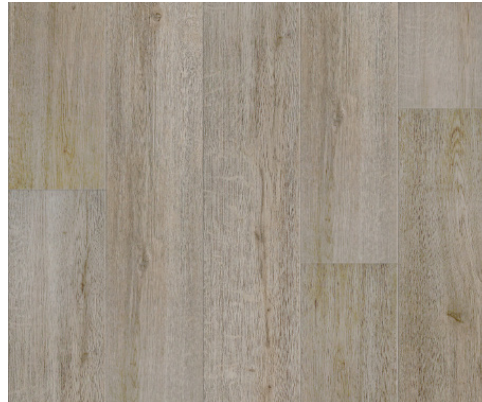
Primrose | CTCRC0103