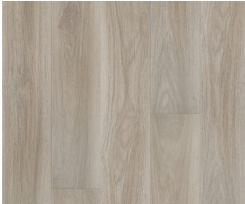
Mimosa | CTCRC0102