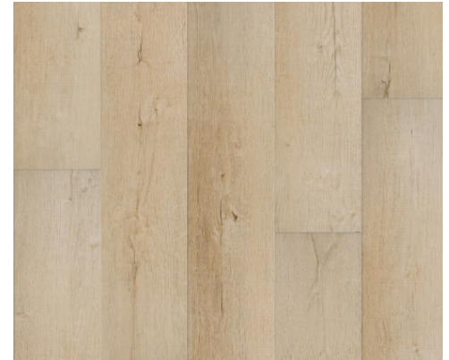
Gardenia | CTCRC0106