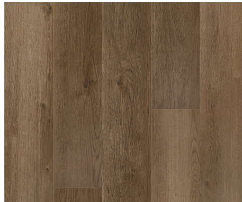
Sloop | CTCRC0205