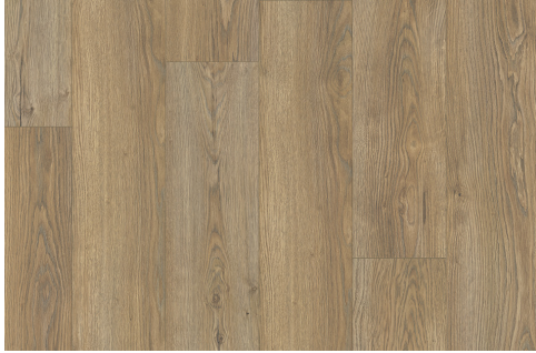
Buttermilk* | UMLI22081