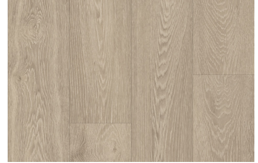
Gold Creek* | UMLI22084