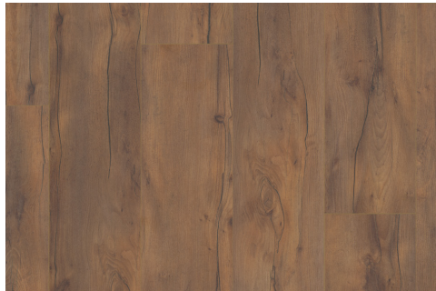
Oberlin | UM162542208