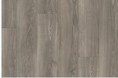
Monarch Oak* | UMLI22082