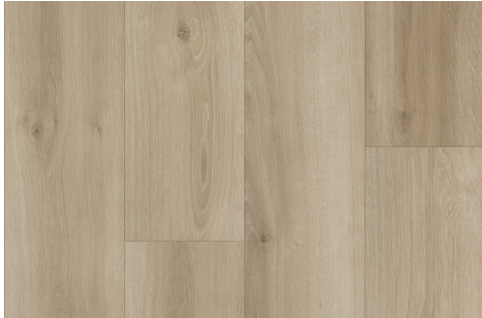
Yellowstone* | UMLI22085