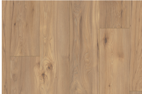
Miller Lake | UM162542204