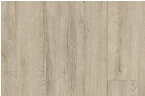
Simcoe | UM162542207